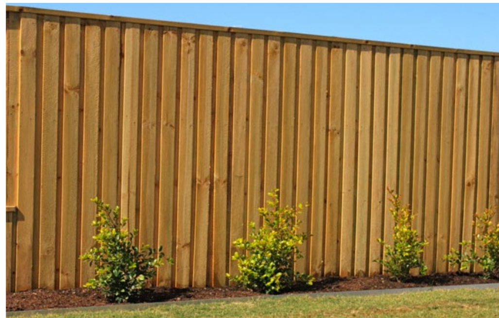
treated pine lap and cap fence: height 1.8 m