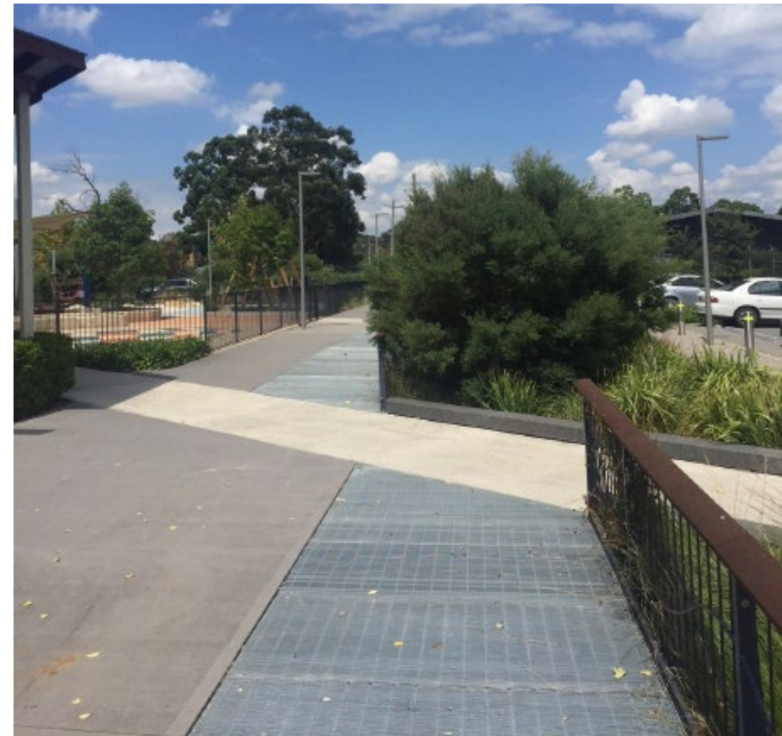
perforated FRC deck over Bio swale

G 12.07.2019 CLIENT REVIEW F 09.07.2019 CLIENT REVIEW D 30.08.2018 CLIENT REVIEW REV: DATE: COMMENTS: