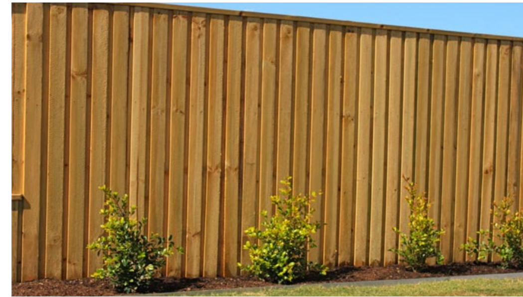
treated pine lap and cap fence : height 1.8 m