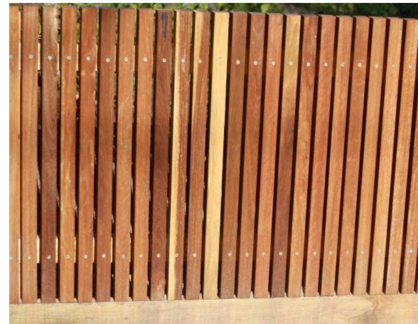
timber batten fence : height 1.8 m

PROJECT: HARRINGTON WATERS LIFESTYLE VILLAGE