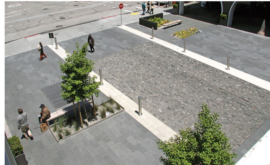
shared plaza with vehicular road, seating and planter