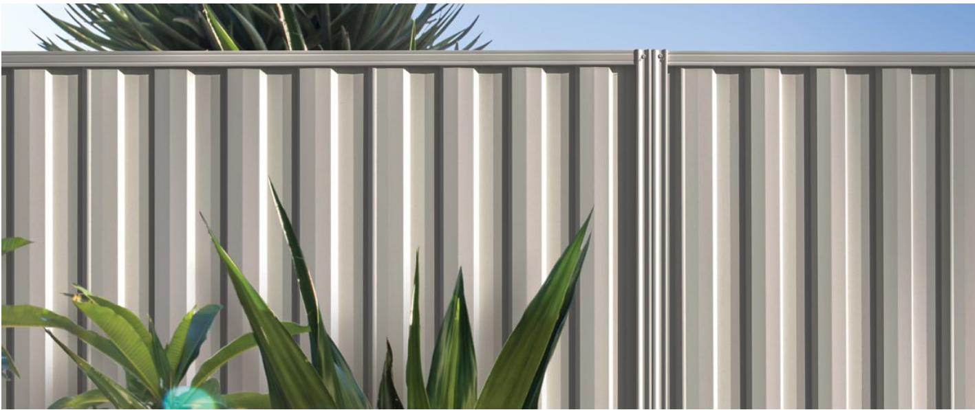
colorbond steel fence: height 1.8 m